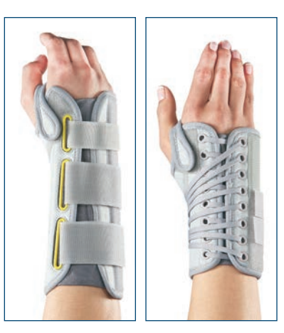
RESTRICTIVE MOVEMENT SPLINTS: Allard's Vission Laced and Strapped WHOs (above) and Allard's S.O.T. Thumb Splint (below)

weak or paralyzed muscles. The resting position can help with improving circulation and can support both the hand and finger joints, reducing the risk of hyperextension of the thumb.