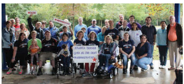
ATLANTA, GA: Walk and Roll 4 CMT