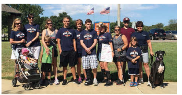
DALLAS, TX: Dallas STARS Walk4CMT