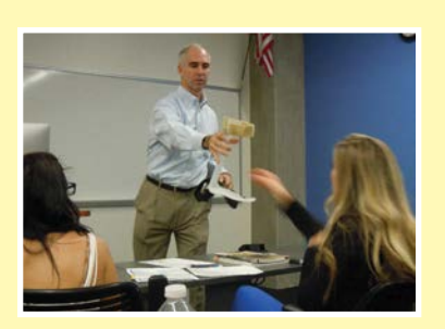
Branches benefit from visiting professionals... See page 14

that makes fireflies glow. The compound screen is designed to detect the down regulation of PMP22, the duplicated protein that causes the nerves in CMT1A to demyelinate. After three tedious weeks of running (continued on page 2)