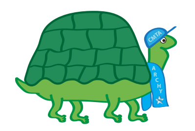
"Archy," our mascot, writes for the CMTA newsletter about his experiences as a turtle with CMT.

ell, school is back in session and I'm in my usual blue funk because I am missing all the fun I had this summer. School isn't bad, mind you, but it can't compare to having friends over and swimming and just generally fooling around on a hot summer day. Factor in that I went to Australia this summer and you can imagine why going back to school doesn't seem all that exciting.