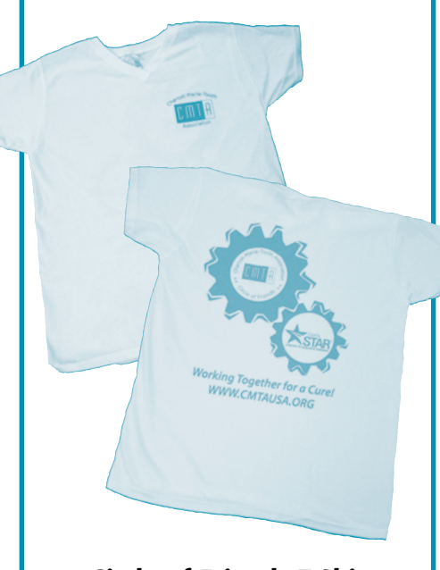
Circle of Friends T-Shirts