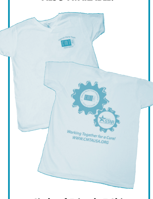
Circle of Friends T-Shirts