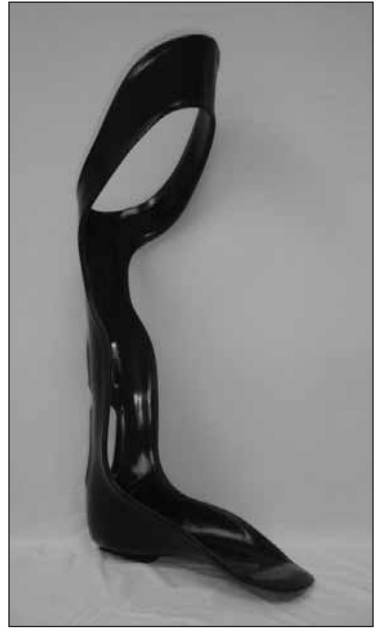
A view of the entire Helios® brace in thermoplastic

Though the thermoplastic Helios is not carbon fiber, it can be reinforced in areas with carbon-fiber. It will still produce more superior results than any off-the-shelf brace. Since this brace is taken from an actual leg mold, it is custom-designed and modified with the typical Helios design corrections. A custom fit, with proper alignment and correction for balance, will give the wearer more benefit than any off-the-shelf, and many standard custom, plastic designs that are currently available.