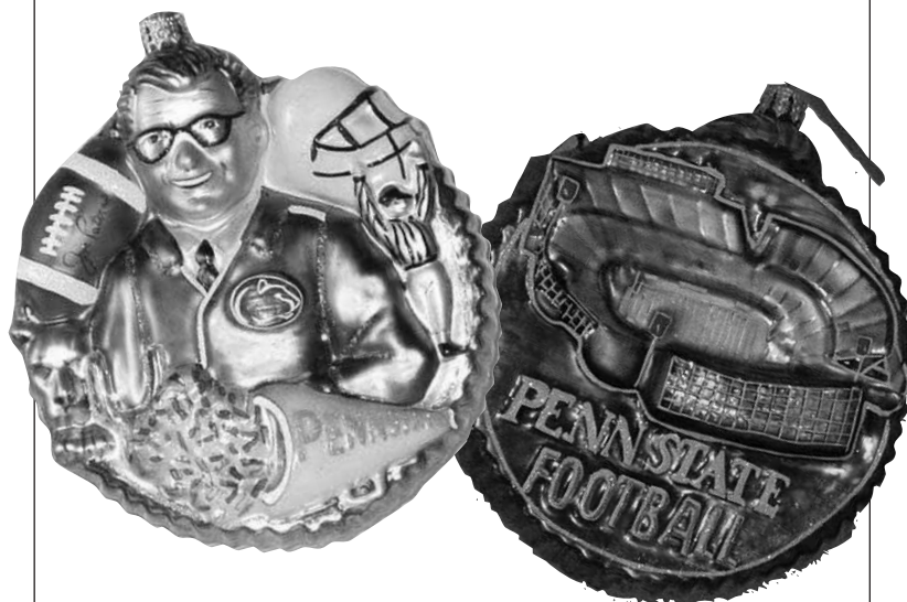
The front of the Radko Ornament features the likeness of Coach Paterno and the back shows Beaver Stadium, the home of Penn State football.