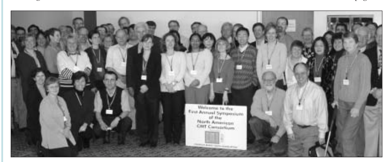
More than seventy international CMT researchers and clinicians met in London, Ontario, Canada for the inaugural session of the North American CMT Consortium.