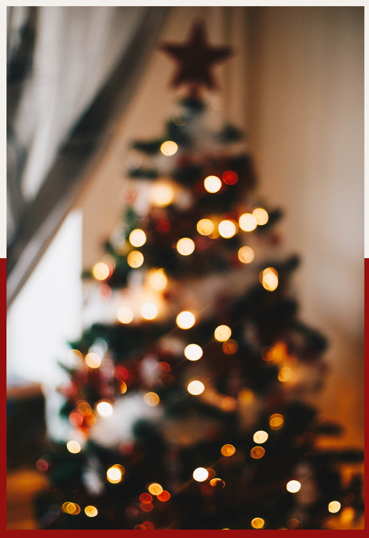
A VERY MERRY Holiday Gala