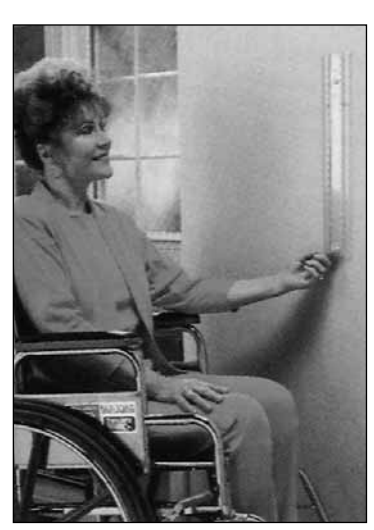
A wall-switch extender brings light switches to a convenient level.

A vertical outlet extension device brings baseboard electrical outlets up to the wheelchair user or anyone else with reaching or bending limitations. No special wiring is needed; it just plugs into an existing outlet. A pull-plug device makes it easy for people with weak hands to insert and remove stubborn electrical cords.