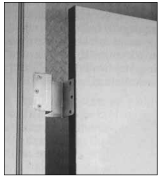
Offset door hinges are a cost-effective way to add one to two inches to a doorway.

Doors that are hard to open because they rub on the floor or carpet can be adjusted without removing them. Put a large piece of sandpaper on the floor under the door and move the door back and forth a few times. You may need to put some newspapers under the sandpaper so