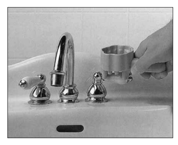
A tap turner makes using the sink easier.

At my computer, I plug all of my computer equipment—the monitor, printer, and CPU—into a six-outlet power surge protector I bought at the hardware store. By pressing one switch, I turn on all my equipment at once. You can do this, too, when you have several items you want to turn on all at one time.