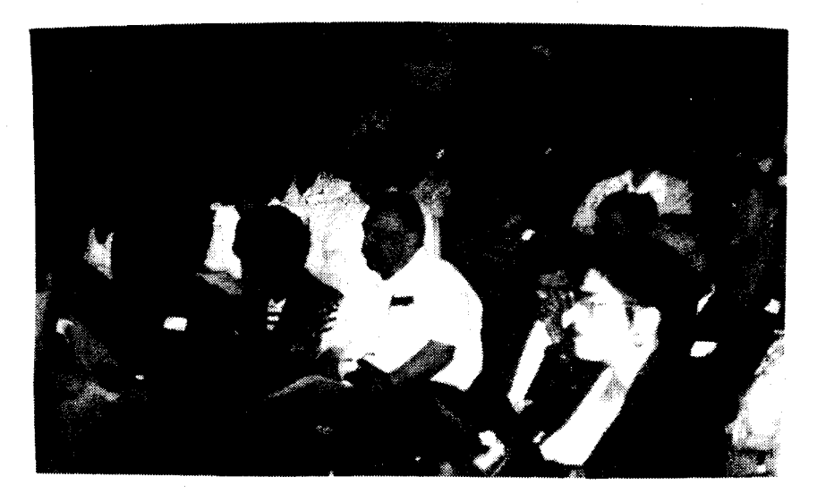
Delaware conference participants