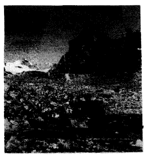
Himalayan Mountain Camp

The problems of the group continued to multiply. The plane to the mountain flew on a whimsical schedule and at least half of the groups' very necessary equipment (special cold weather tents and clothing) would not fit on the plane. The greatest problem arose when they learned that, while being fitted with the crampons, their boots