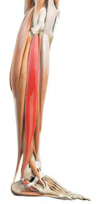
Figure 2: THE PERONEUS LONGUS

the inside of the arch and helps support it, much like a cable on a suspension bridge. Its pull is normally balanced out by the pull of the peroneus brevis tendon, which inserts on the opposite side of the middle of the foot. These two tendons are what allow the foot to move side to side and stay flat on the ground when walking. In a CMT patient, the posterior tibial stays strong compared to the peroneus brevis and causes the progressive inward turn of the foot. That's why many of you can turn your foot inward much better than you can turn it outward. The most important part of CMT cavovarus surgery is the balancing of these tendons, both to improve function and to minimize the use of braces.