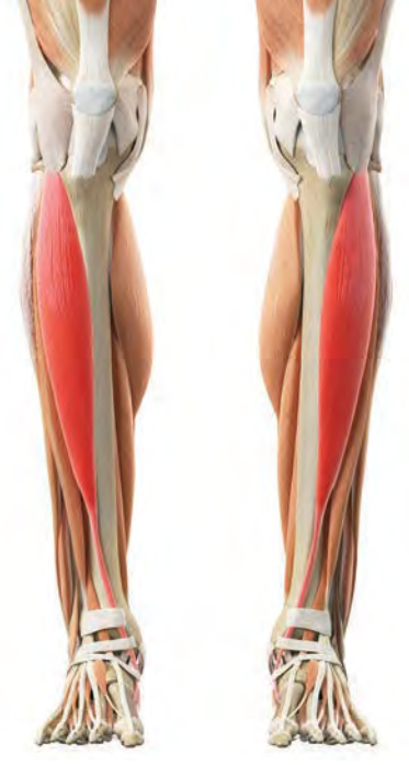
Figure 1: THE TIBIALIS ANTERIOR

The tibialis anterior is the main muscle that lifts up the foot