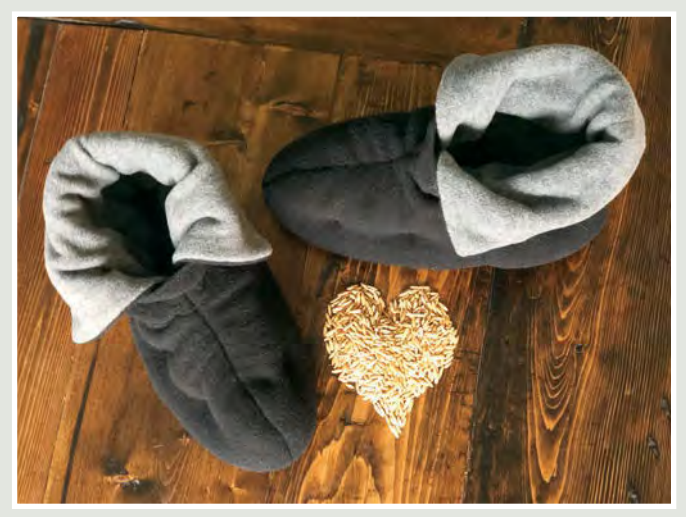
CosySoles is a proud supporter of CMTA and donates 50 cents for every pair of CosySoles sold to the organization. In addition, the company is offering 10 percent off to readers of The CMTA Report (enter code CMTA at checkout on www.cosysoles.com).

Back then, their only solution was to immerse her feet in hot water, which restricted her in many ways. Determined to develop a product that was warm and comfortable and allowed for mobility, Dad single-handedly stitched the very first pair