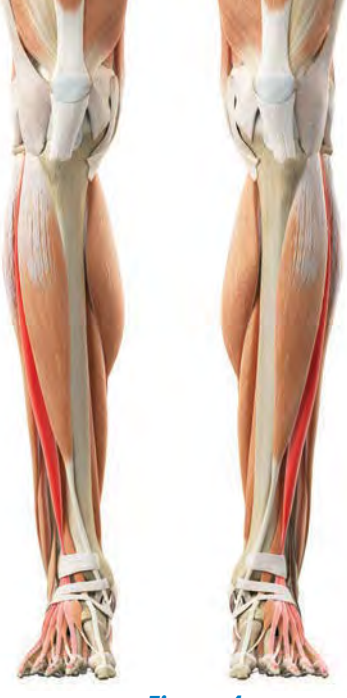
Figure 4: TOE EXTENSOR TENDONS

A final key transfer has to do with the toe extensor tendons that run down the top of the foot (Figure #4). If sufficiently strong, I frequently transfer these tendons into the midfoot, at the top of the arch. The toes no longer deform