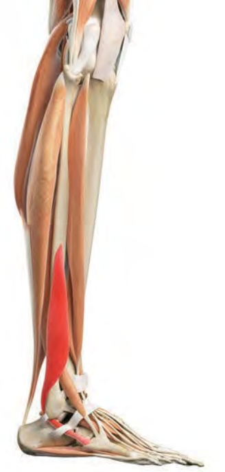
Figure 3: THE PERONEUS BREVIS

If the posterior tibial tendon functions, it can be transferred from the leg to the top of the foot. This accomplishes two important things. First, it takes away the deforming force of the muscle that twists the foot inward. Second, it provides strength for the ankle to move up. This can make all the difference to someone who wants