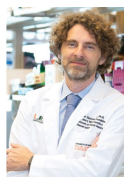
Dr. Stephan Züchner

With next-generation sequencing, it is possible to sequence large amounts of DNA, such as all the pieces of an individual's DNA that provide instructions for making proteins. These pieces, called exons, are thought to make up some 2 percent of a person's genome.